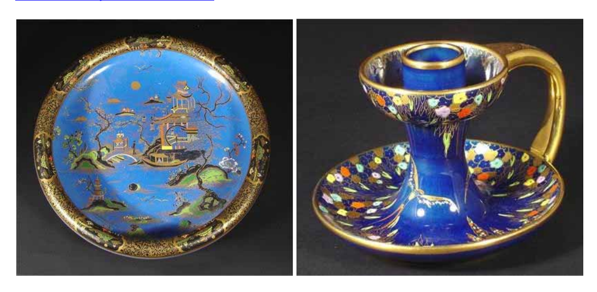
Lot 951: TEMPLE , 12½" floating bowl, pattern 2929 , gloss blue & matt black Lot 952: Fantasia chamberstick, pattern 3421 , gloss powder blue