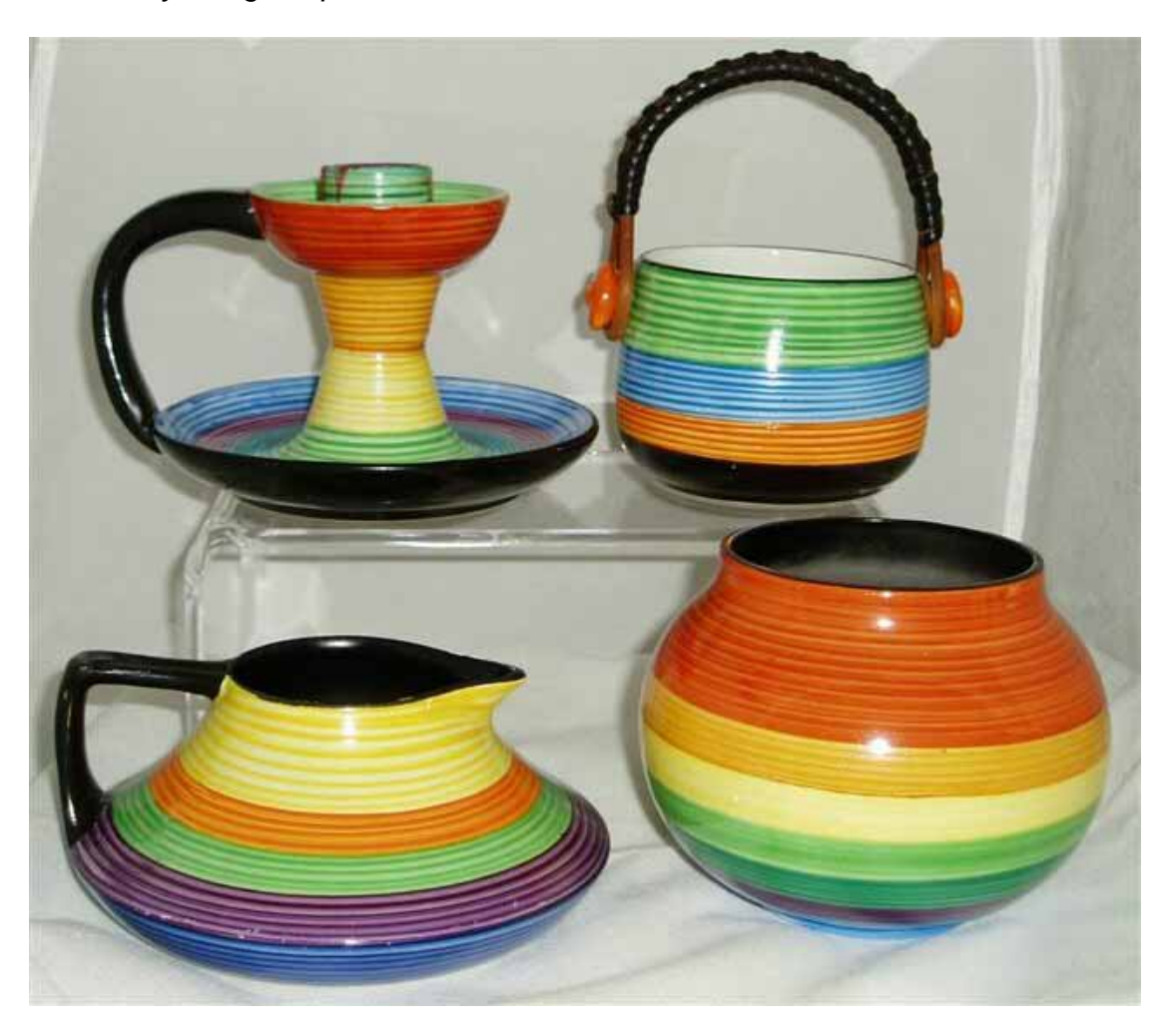
Medley pattern (clockwise from top left) Chamberstick pattern 3587 Pot with wicker handle, pattern 3593 3½" vase, shape 442, pattern 3587 Jug pattern 3599

"Whilst I had out the photographic tent and tripod, I thought I'd also take a picture of my small collection of Medley pieces - showing variations of this striking, vivid and artfully designed pattern."