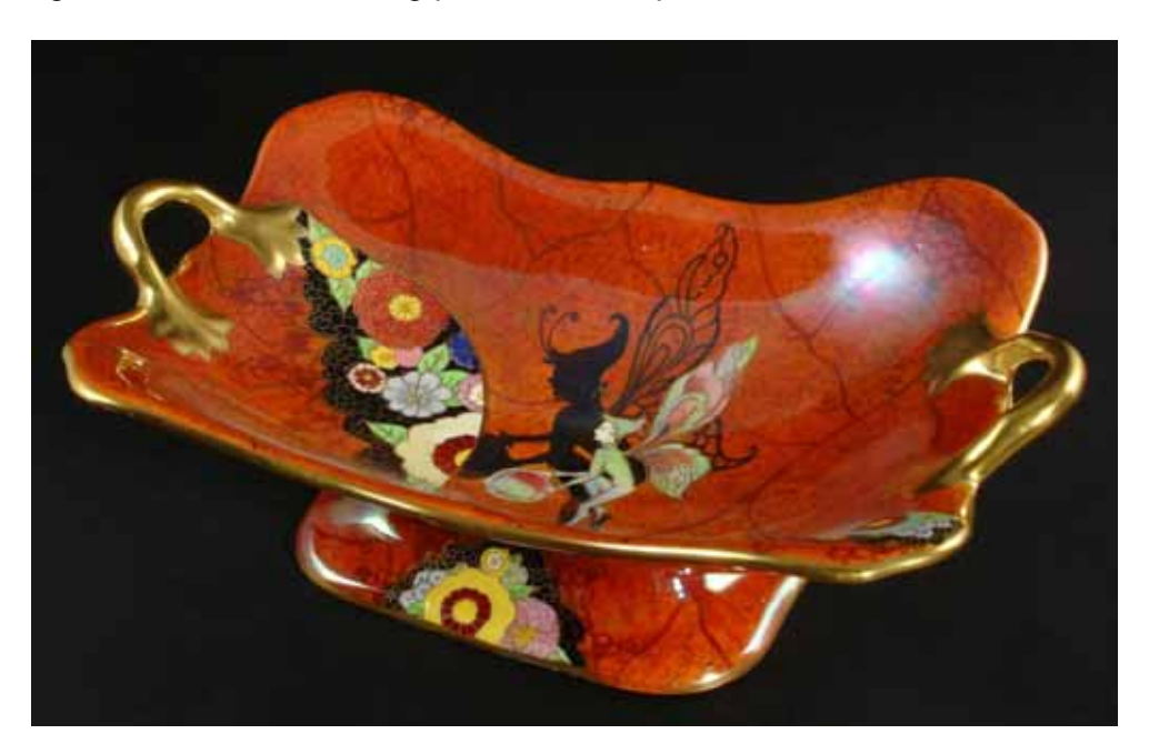
FAIRY 12" pedestal bowl, pattern 3576, lustre orange

This pattern seems to have only been produced in two colourways, the Lustre Blue pattern number 3564 and a Lustre Orange pattern number 3576 . A beautiful example of this colourway was most recently seen at the Woolley & Wallis sale a year ago when the outstanding pedestal bowl pictured below sold for £2,000.