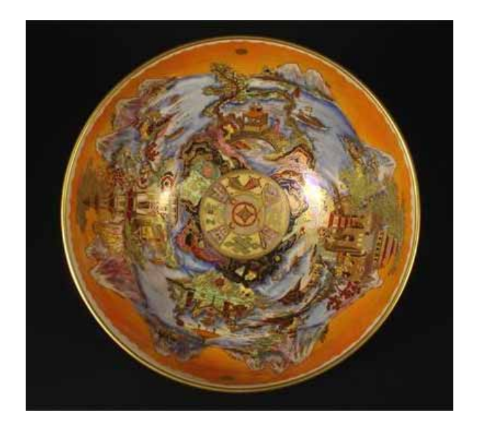
Lot 953: CHINALAND 10" bowl, pattern 2948, orange lustre