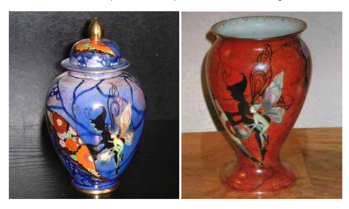
FAIRY 7" ginger jar shape 311, pattern 3564, lustre blue FAIRY 7" vase shape 406, pattern 3576, lustre orange