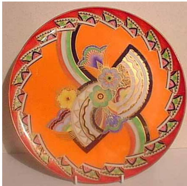
Rainbow Fan 32cm charger pattern 3699 gloss orange

For the start of a new year, we thought that we would cheer up all our northern hemisphere readers with a pattern featuring an element we do not see this time of the year, a rainbow! Of course, our Australian readers would also like to see this weather feature, as it would mean that they were receiving some much needed rain! However, it seems that in both Carlton Ware and (currently) the weather this pattern can be called "rare"!