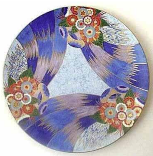
Floral Comets 39cm chargers pattern 3387 matt green and 3405 matt blue