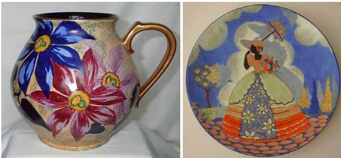
CLEMATIS 18cm jug pattern 3525

In common generally with Handcraft another example of artistic expression can be found on the CLEMATIS 3525 . Each piece is virtually a “one off” owing to the liberal parameters the artists were given and all the more fascinating because of it. Paintresses and gilders marks can be found on pieces and recorded in the hope of ‘matching up’ but sadly it is unlikely that we will ever know the ladies names. We have been very interested to see for the first time, designers’ names given in some recent catalogues. A thought on production runs; we have always wondered for instance how many “best ware” pieces of identical nature were produced. It is probably difficult to generalise but take for example a VICTORIAN LADY charger or a Bell vase 3788 (Ruby Lustre). There really does seem to be such a few known pieces in existence; couple that with unknowns, delete a large proportion lost over the years and it becomes interesting. Could the factory have manufactured as few as a hundred pieces of some of these expensive and complicated designs? This finite source should perhaps concentrate the minds of the existing custodians. A bonus is to find the pieces so generously marked on the base. If it were possible to relate the batch/order numbers to documentation it might well assist in volume of production, but this appears an impossibility.