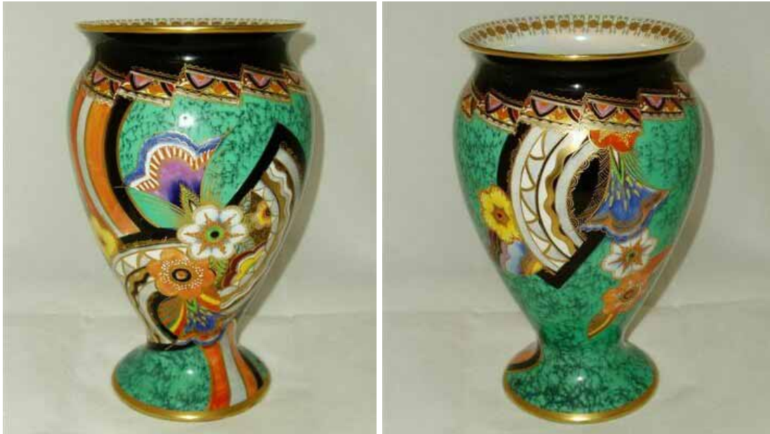
Rainbow Fan 20cm 406 vase, pattern 3700 mottled turquoise (front & reverse)

There are 4 difference colourways in this pattern: