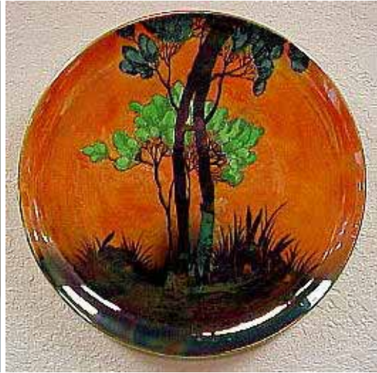
32cm chargers DAISY pattern 3693 matt blue and RABBITS AT DUSK pattern 4249 gloss orange