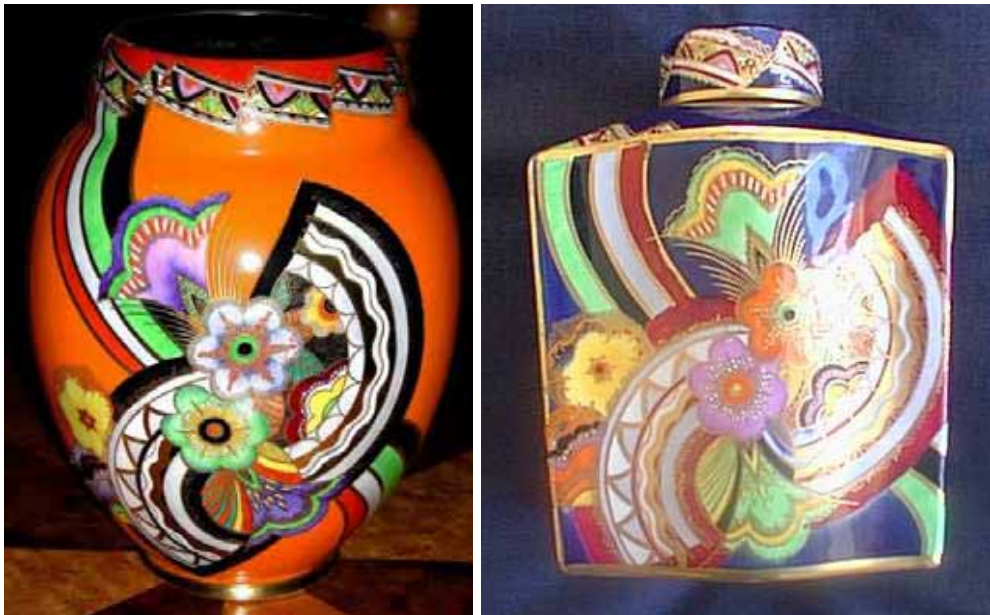
Rainbow Fan 19cm 456 vase, pattern 3699 gloss orange Rainbow Fan tea caddy pattern 3713 lustre blue