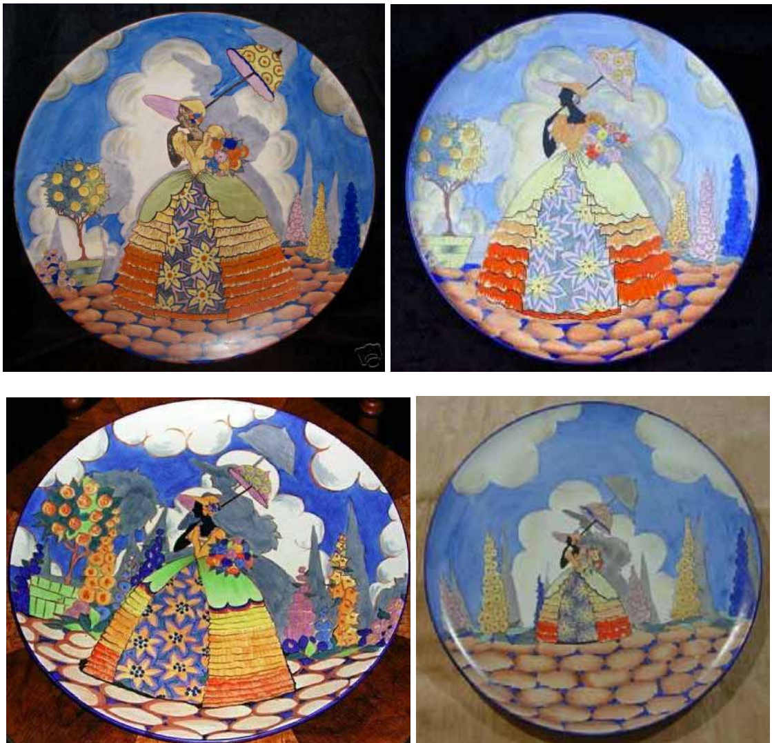
Four VICTORIAN LADY 39cm chargers pattern 3451 Note multiple pattern differences on all chargers including size of lady, cloud formation, garden flowers, and colours used.

There are many superb patterns from say the Handcraft RUSSIAN 3567 with its roundel design to the underrated Fantasia 3388 (blue). However, it is the 'Handcraft style' range that seems the most intriguing, one such design on the matt format being VICTORIAN LADY 3451 . This plaque is sometimes found depicting a large lady and on other occasions with a smaller female version with corresponding adjustments of design. By reference to those we have seen either first hand or via auctioneers catalogues no two chargers are the same. Even with two ladies of comparable size! There are subtle nuances that define originality such as colour and number of flowers and shrubs. The painters were obviously allowed considerable licence in application of this freehand style.