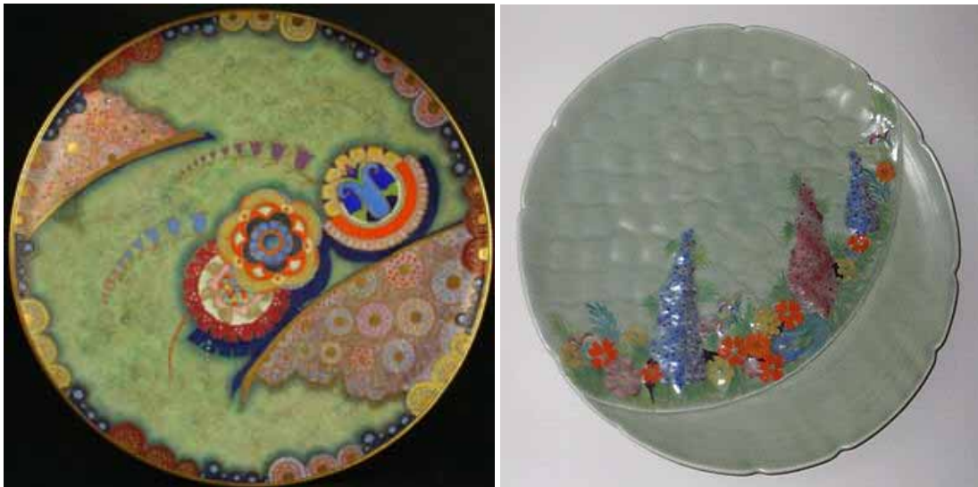
32cm chargers Bell pattern 3786 matt green and ROCK GARDEN

Like the 'Best Ware' pieces the golden period seems to be the 1920's and 30's. They appear to come in two sizes, the more common diameter of 32cm or so and the rather less common of 39cm or thereabouts. We find these artefacts finished in either lustre, such as Heron and Magical Tree 4160 , matt such as Bell 3786 (green), the floral embossed ROCK GARDEN pattern or Handcraft such as Carnival 3305 .