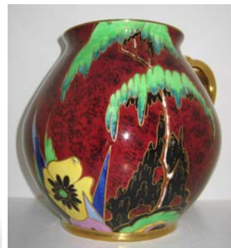
Pattern 3424 matt buff, 3449 gloss orange & 3455 Ruby Lustre