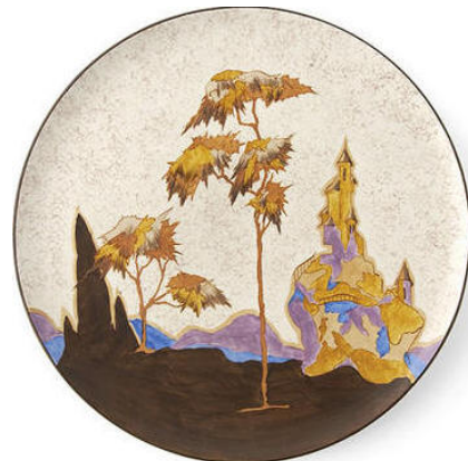
Towering Castle 3458 matt brown