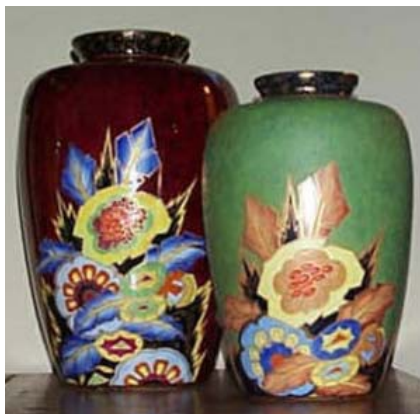
Jagged Bouquet 3439 Ruby Lustre 3457 matt green