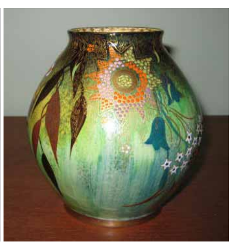
Shape 456 Shape 457 Shape 463