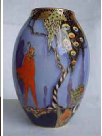
Shape 406 Shape 442 Shape 443