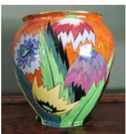
Shape 464 Shape 465 Shape 466