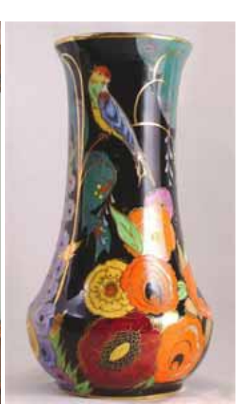
Shape 226 Shape 314 Shape 326