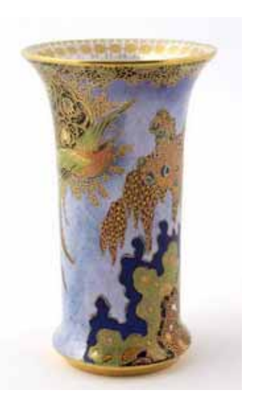
Shape 139 Shape 167 Shape 217